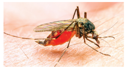
Culex (top), Aedes (middle), and Anopheles (bottom) are among the most significant genera of mosquitoes.