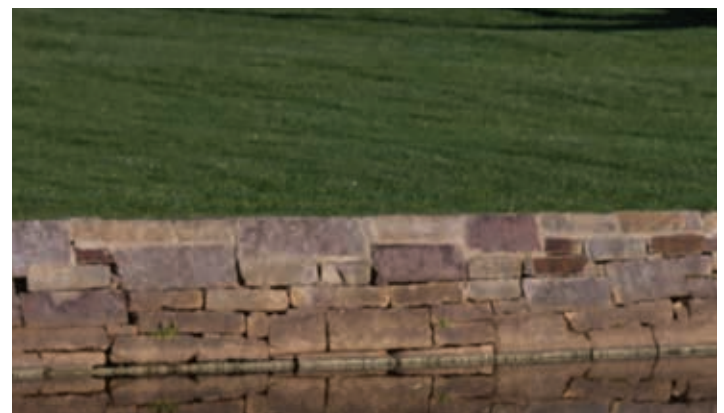
Fast, effective non-selective control of emerged annual and perennial weeds.