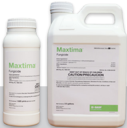
Available 4 x 26 fl oz and 2 x 2.5 gal

Maxtima® fungicide is the new turf-safe, broad-spectrum demethylase inhibitor (DMI) you can afford to spray at any temperature, on any turf, anywhere on your course to bring disease-free playing conditions to more areas than ever before.