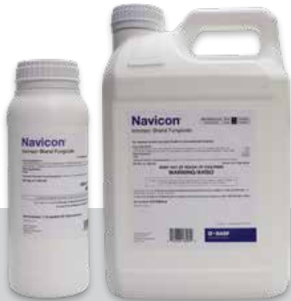
Available in 4 x 37 fl oz and 2 x 2.5 gal

Navicon® Intrinsic® brand fungicide is the new broad-spectrum demethylase inhibitor (DMI) and strobilurin combination. Spray it on any turf at any temperature for effective control of the toughest diseases while providing strong plant health from the roots up.